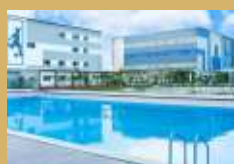
18 mins to Candidus International School