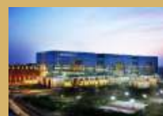
32 mins to Financial District