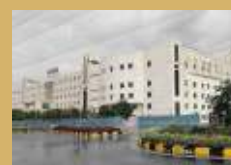
15 mins to Gitam University