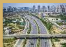
18 mins Outer Ring Road