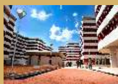
12 mins to IIT, Kandi