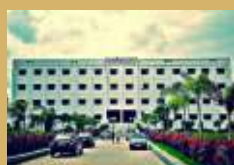
5 mins to Maheshwara Medical College

Closely surrounded by many Residential & Villa Projects, reputed International Schools & Colleges