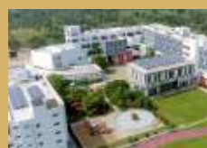
30 mins to Birla Open Minds School