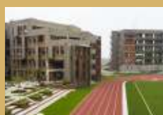
25 mins to The Gaudium School